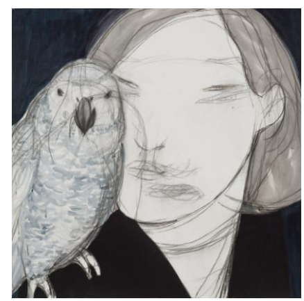
Iris Schomaker, Untitled (Parrot) , 2010, watercolour and oil on paper, 120 x 110 cm / 47.2 x 43.3 in