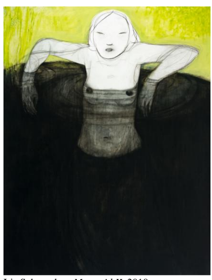
Iris Schomaker, Mermaid II , 2010, watercolour and oil on paper, 240 x 185 cm / 94.5 x 72.8 in