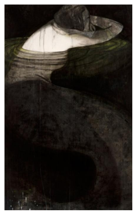
Iris Schomaker, Mermaid VI , 2011, watercolour and oil on paper, 240 x 150 cm / 94.5 x 59 in