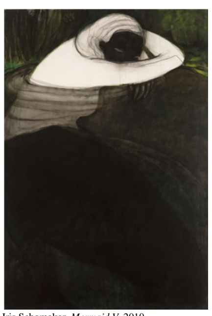
Iris Schomaker, Mermaid V , 2010, watercolour and oil on paper, 236 x 160 cm / 93 x 63 in