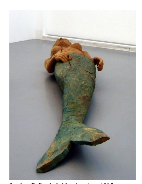
Stephan Balkenhol, Meerjungfrau , 1995, oak wood, 440 cm long / 173 in length

In a similar way, if with far more political ambition, the artist duo Elmgreen & Dragset worked with the sculpture of the Little Mermaid in Copenhagen. When the two artists placed a mirror alongside the city's trademark to mark the Copenhagen Quardriennale, this was intended to visualize the self-centeredness of the Danish government. In both cases the mermaid was not to be taken seriously as a subject, but at best a welcome and familiar symbol that either mutated into an emblem of the superhuman