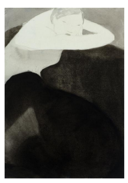
Iris Schomaker, Untitled , 2010, gouache and oil on paper, 30 x 21 cm/11.75 x 8.25 in

To return to the notion of the primal image that the artist herself has used to characterize her works, Schomaker's recourse to the mythical figure of the Undine means not only an artistic translation of a memory image rooted in our collective treasury of myths to the language of the present. She makes use of an image that can be considered part of a symbolic and