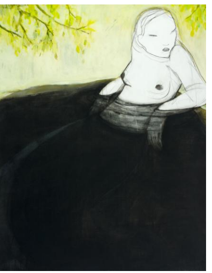
Iris Schomaker, Black Pond III , 2010, watercolour and oil on paper, 240 x 180 cm / 94 5 x 70 9 in

And thus it only becomes understandable at second glance why some of the pictures are entitled Black Pond : on closer inspection, the black surface of the water reveals itself to be a container of an impressive fish tail which develops in full sculptural quality. What might at first shock our habits of vision is striking in its consequence. For the landscape that surrounds the respective black pond in question is only sometimes alluded to in individual tree trunks, while in most of the images the forest scenery is